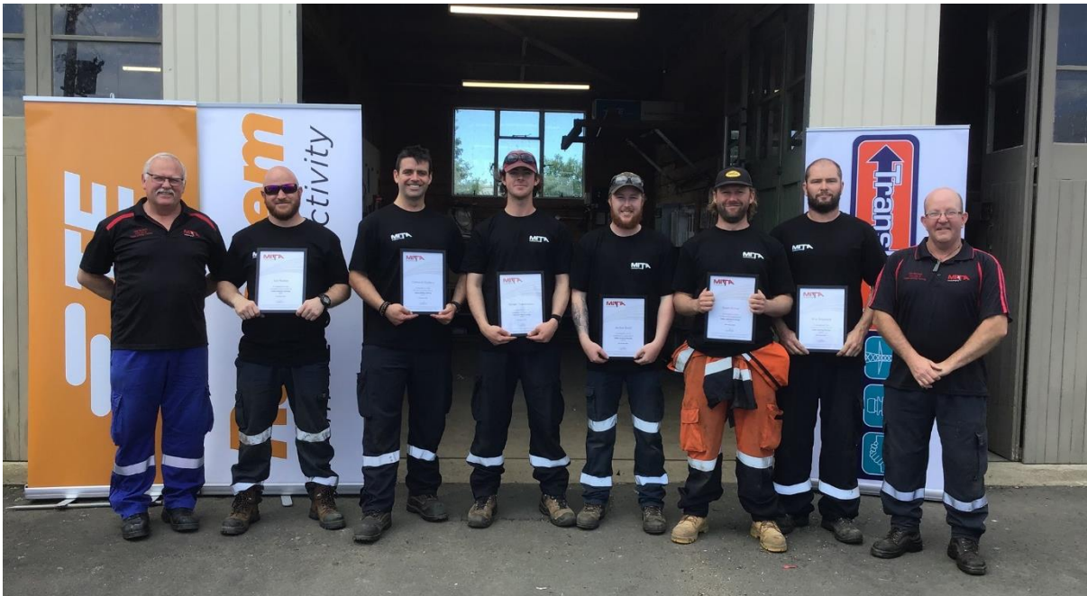
Team Taihape completed their final Cable Jointing Course in October.

We have 5 new Block 1 Line Mechanic Block courses beginning in 2021 which will be running across New Zealand. We also have 3 new Cable Jointing Courses starting next year, courses are filling up fast so contact us to get your staff training booked in.