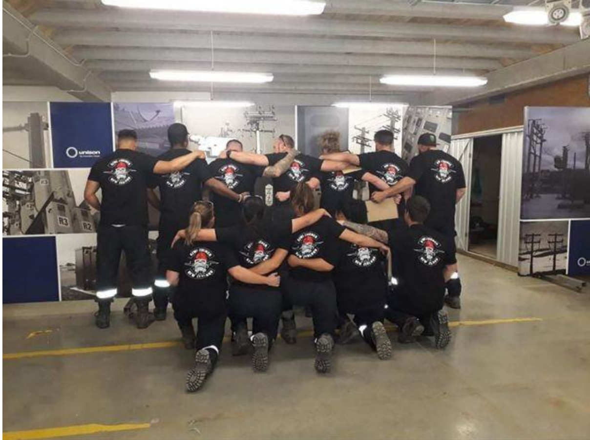
Team Uniform completed their Line Mechanic Qualification in Napier in October.