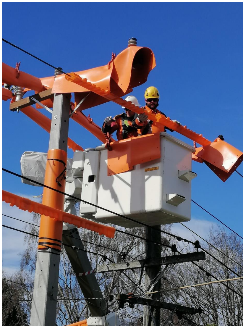
Team Titans during their Live Line training in Dunedin

Thanks to everyone who took the time to complete the survey!