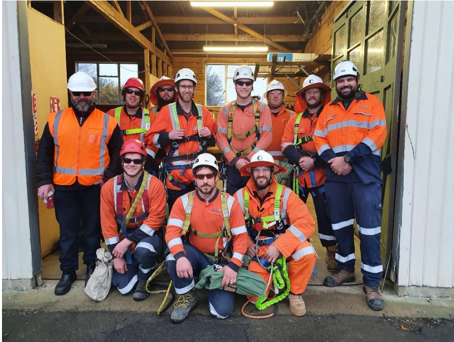
Team Fiat completed the Line Mechanic Qualification in August

Official Newsletter of MITA Consulting Ltd